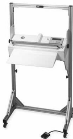
Optional ergonomic multi-position stand (actual model not shown)

Features and specifications subject to change without notice.