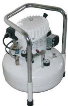
Optional ultra-quiet lab/office compressor

The Accu-Seal 35 helps insure the integrity of your products. When used with a heat sealable, electrostatic safe (ESD), moisture vapor barrier bag with desiccant and humidity indicator card, it provides the maximum protection against moisture and oxygen contamination.