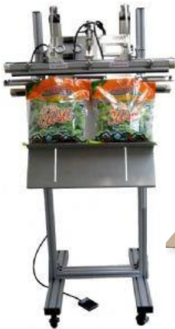
HDMP3 shown with optional product support tray and ergonomic machine stand.