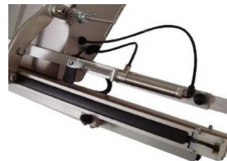
Optional adjustable pneumatic bag stretcher

Features and specifications subject to change without notice.