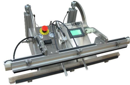
Small Body HDMP3-GV