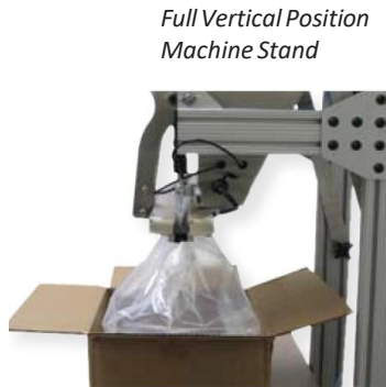
Full Vertical Position Machine Stand